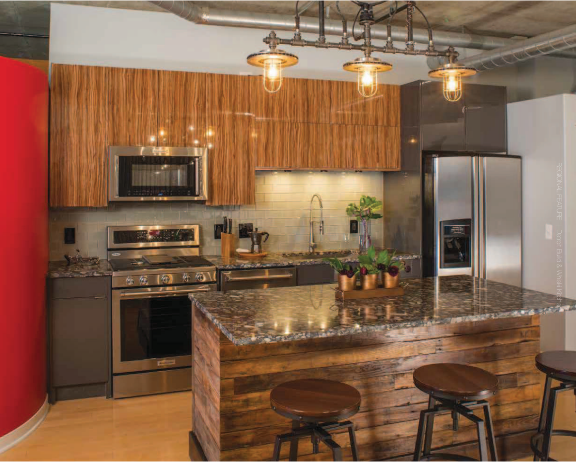
159 SUMMER 2016